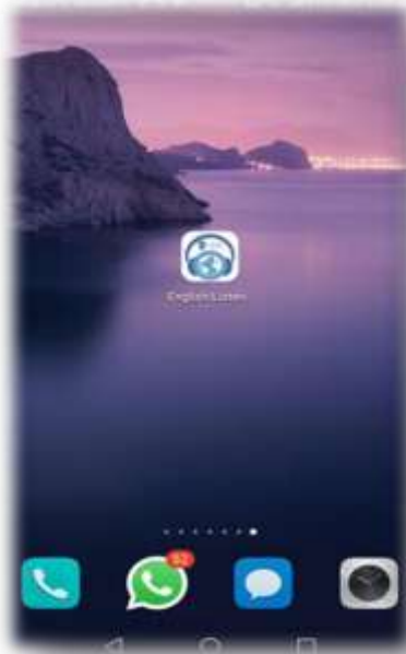
Figure 1: the first phase package

Key words: audio-podcast, mobile learning, smartphones, episodes.