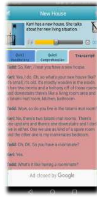
figure 6: the transcript