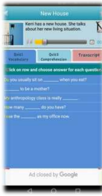
Figure 5: the episode