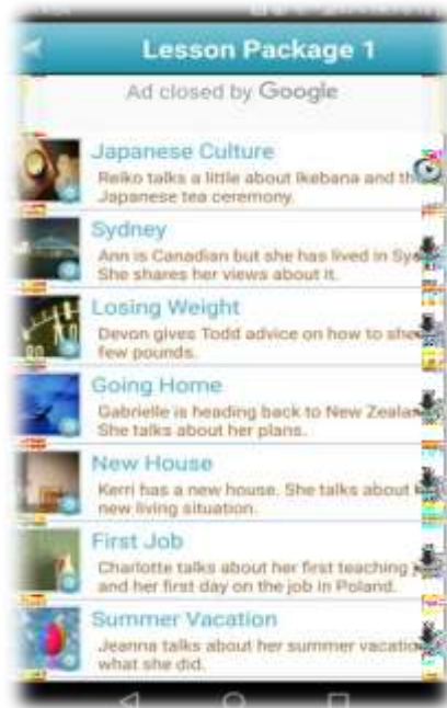
Figure 4: a list of topics