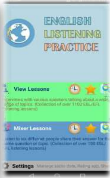
Figure 2: the application interface